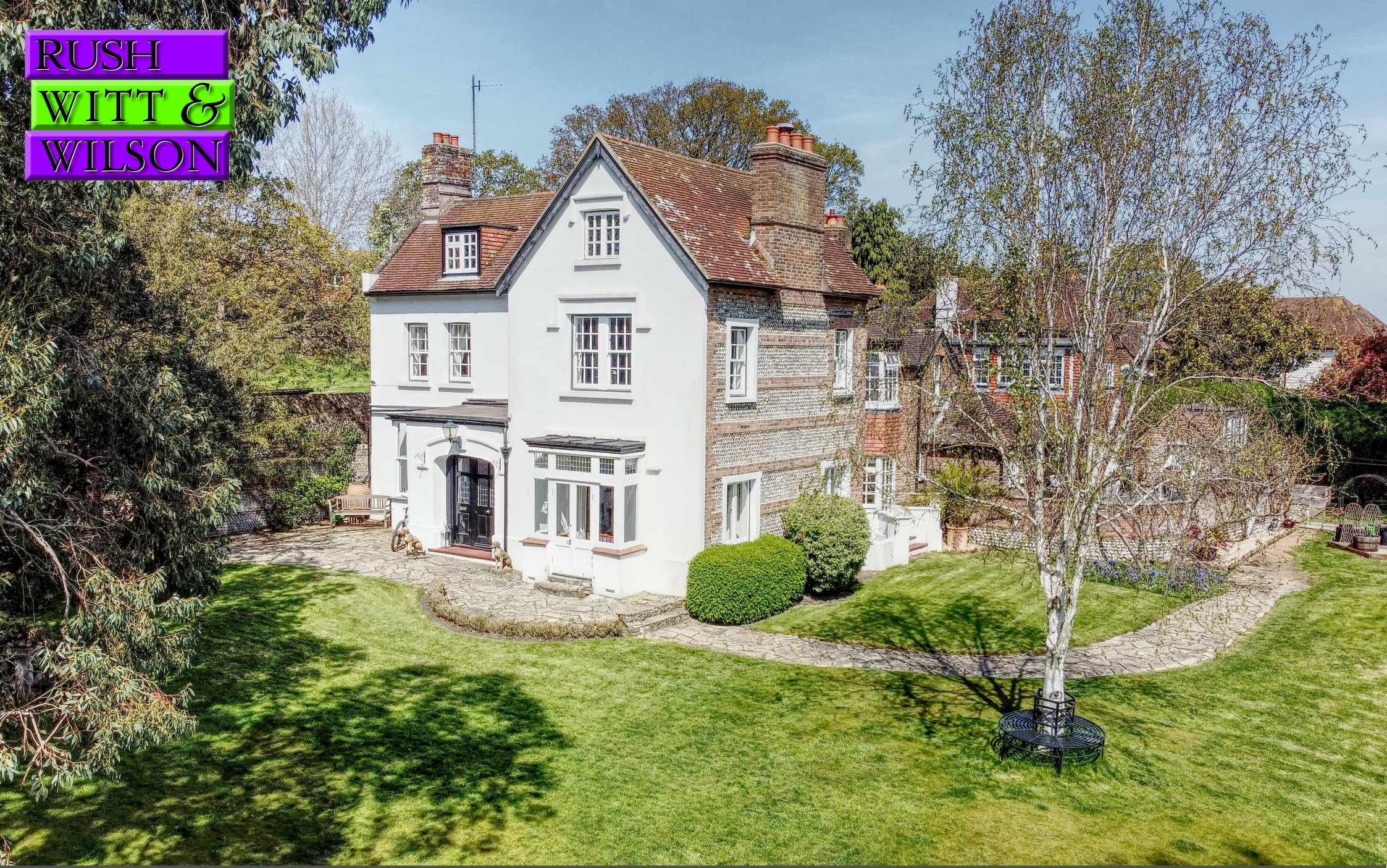
Hurchington Manor Little Common Road, Bexhill-On-Sea, East Sussex TN39 4JD Guide Price £1,345,000